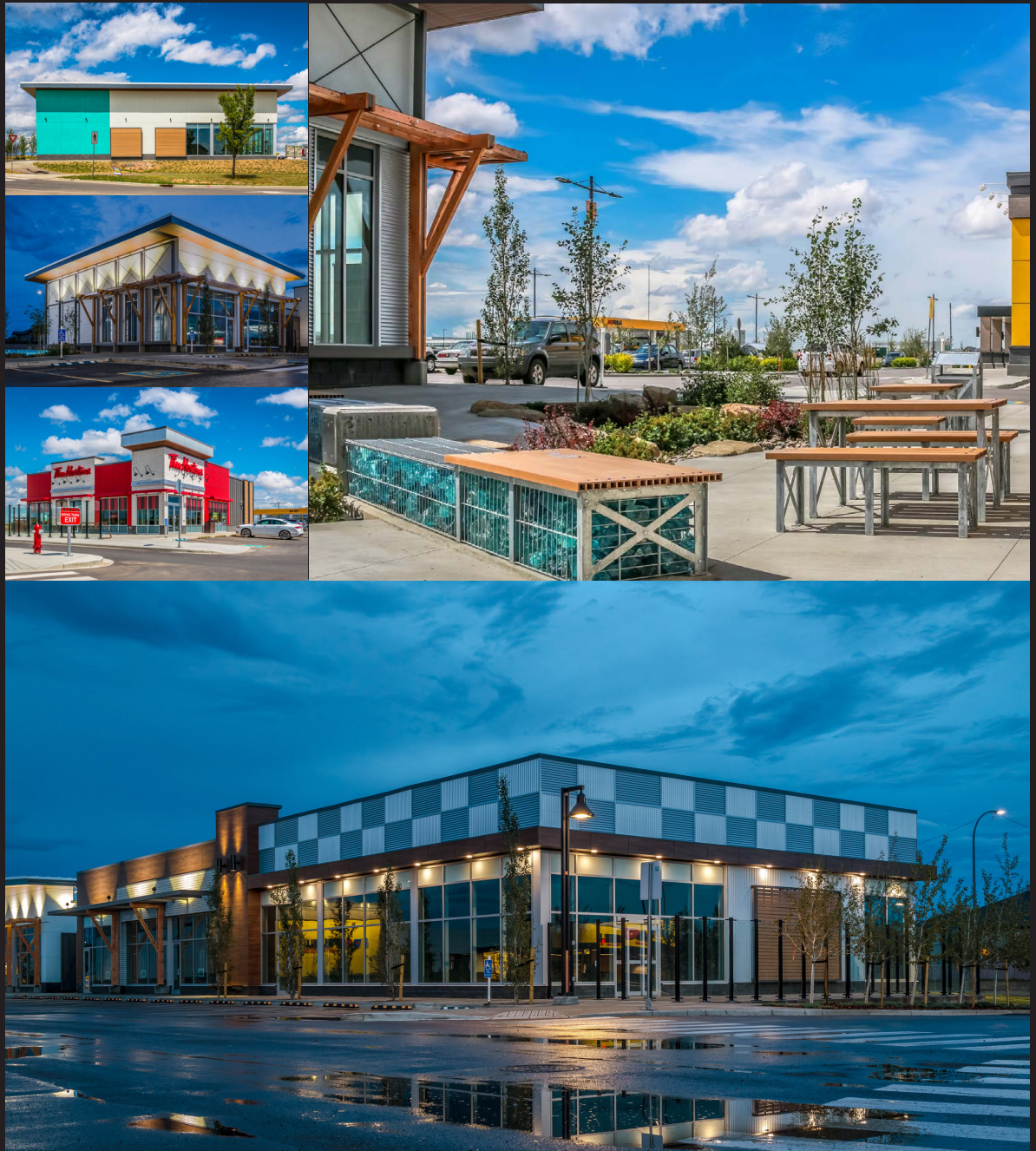
Site + Building Photographs, Substantial Completion Stage - May 2016